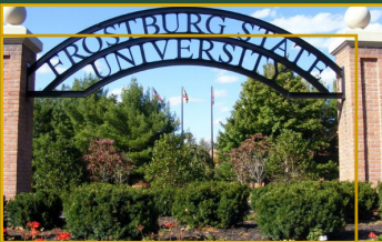
Frostburg State University