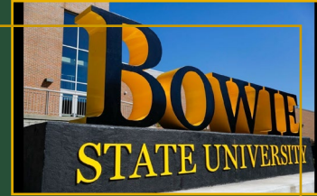
Bowie State University