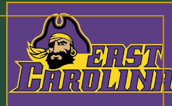
East Carolina University