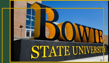
Bowie State University