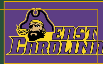
East Carolina University