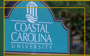
Coastal Carolina University