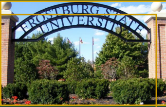
Frostburg State University