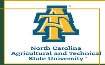
North Carolina A&T State University