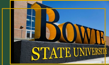
Bowie State University