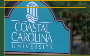
Coastal Carolina University