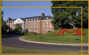
University of Maryland, College Park