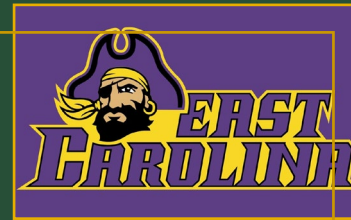
East Carolina University