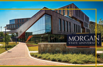
Morgan State University