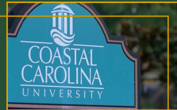
Coastal Carolina University