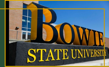
Bowie State University