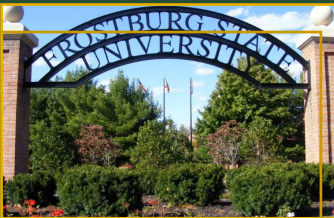
Frostburg State University