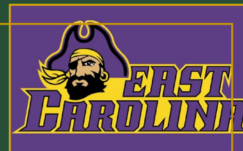
East Carolina University