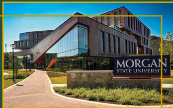
Morgan State University