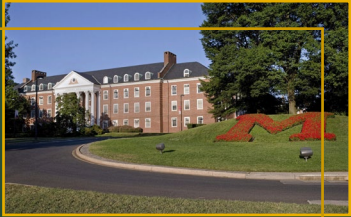
University of Maryland, College Park