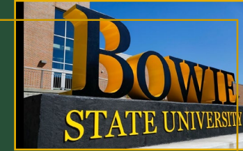
Bowie State University