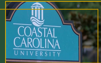
Coastal Carolina University