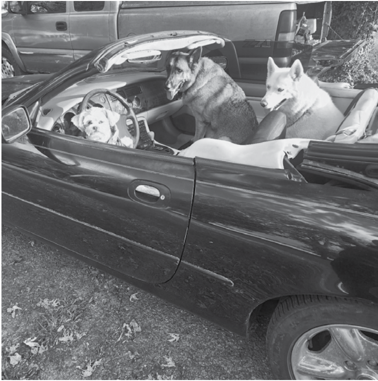
The Getaway, Craig Powell