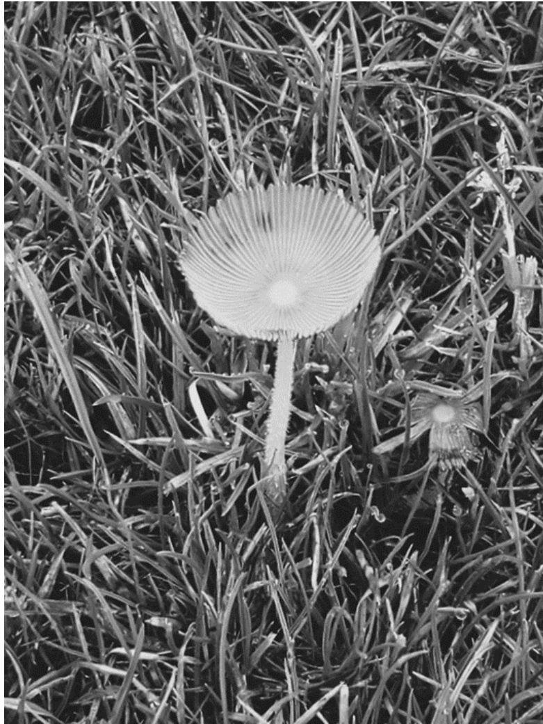
Untitled, Nature's Satellite Dish