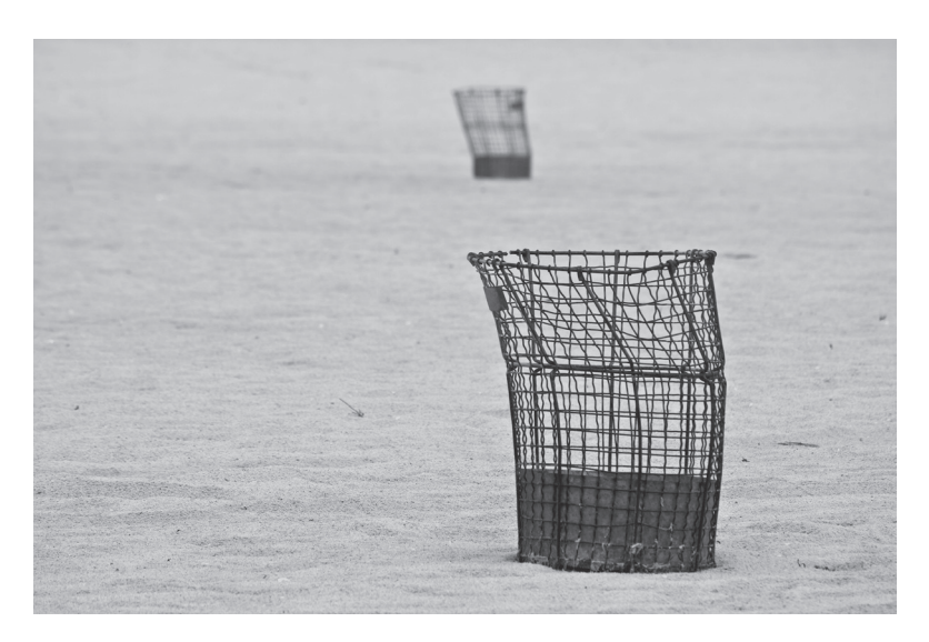
Trash Baskets at Jones Beach, Paul Toscano