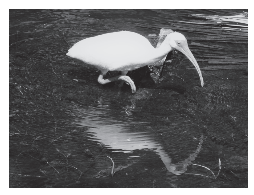
Ibis in the Looking Glass, Ginette Krantz