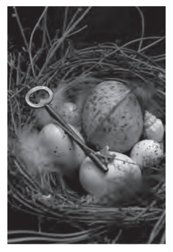
New Beginnings