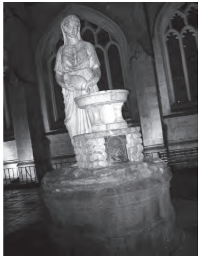
Statue, Bath, England