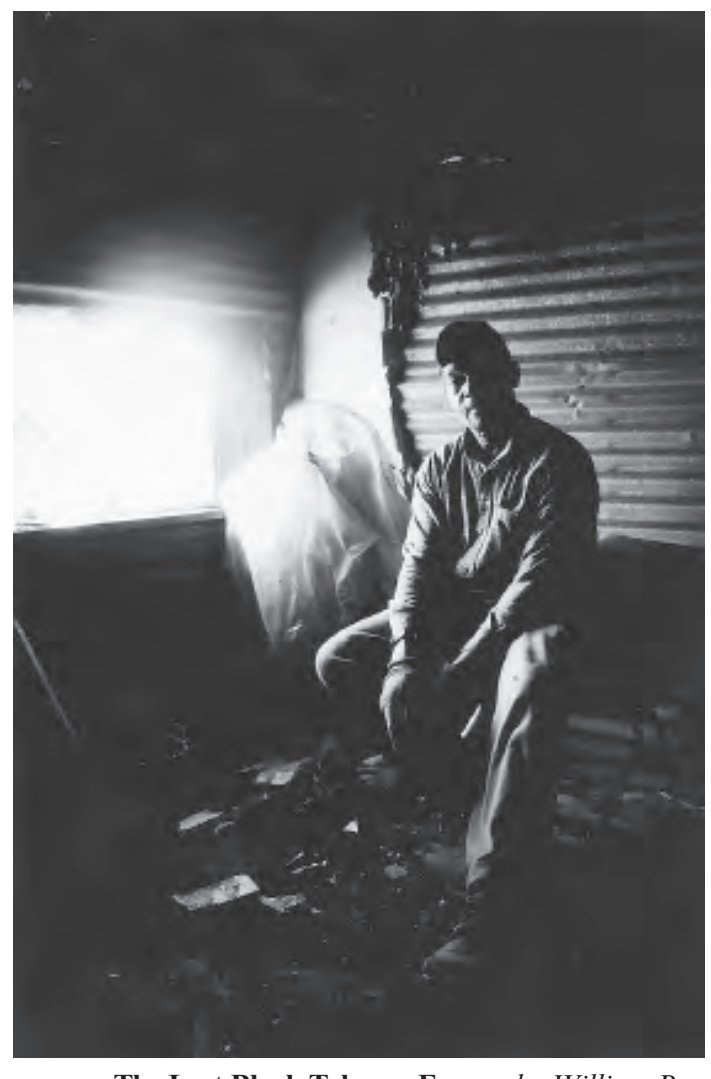
The Last Black Tobacco Farmer by William Poe