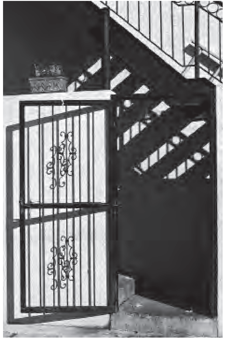
Light and Shadow 2 by Paul Toscano