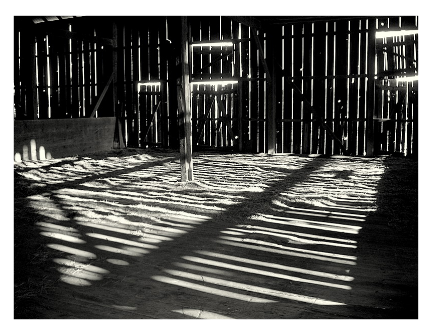
"Room of Shadows"