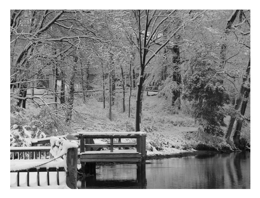
"Pier 1"