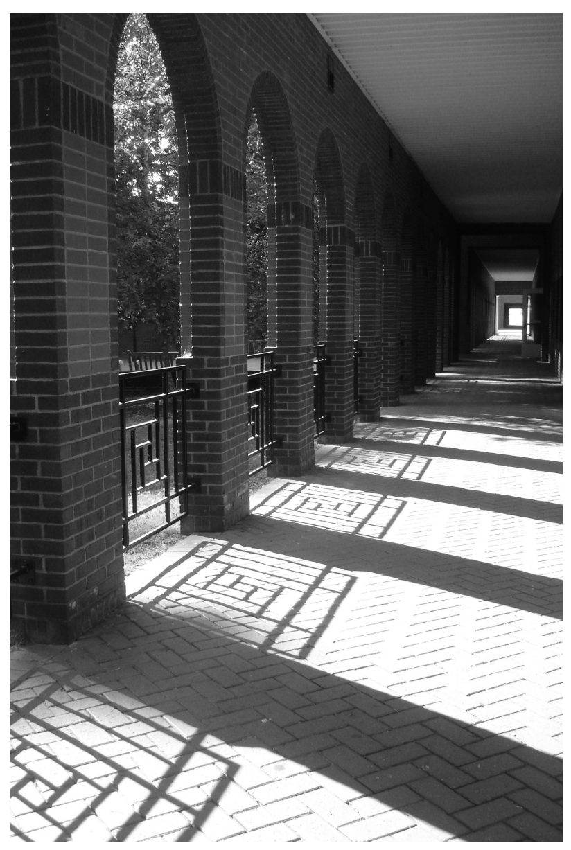
"Arching into Abyss"